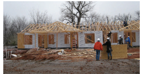
Woodson Park Apartments, recently closed in December continues along with construction.

"2007 ENDED IN A FLURRY OF CLOSINGS —7 TO BE EXACT — ALL IN DECEMBER!"