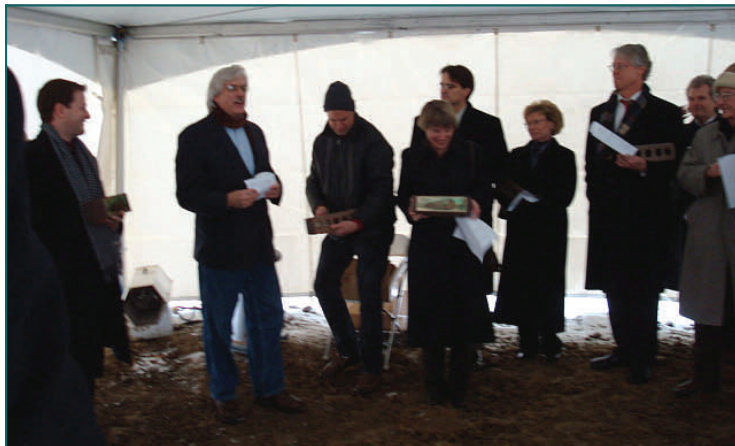
Above: Despite the cold December weather, many partners in the development process were in attendance for the groundbreaking at Stockbridge Apartments and were presented with a brick from Hatch Development Group.