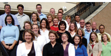
Above: MHEG staff gathers for a photo during the Strategic Meeting

The staff spent much of the day developing new goals for each department as well as strategies on how to obtain those goals. All employees were encouraged to participate and help generate ideas.