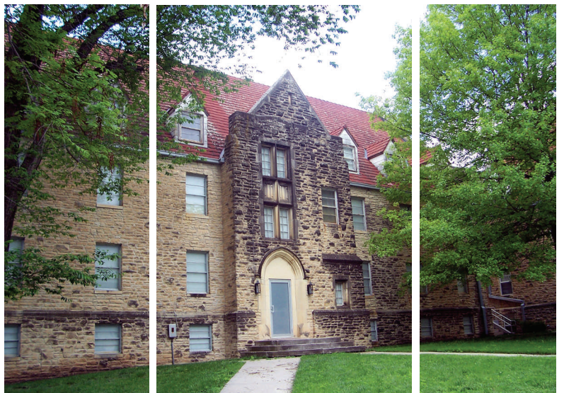
MDI #104 (Mundinger Hall) a historical rehab project, involves renovating an old dormitory for St. John's College in Winfield, Kansas into 1 and 2-bedroom apartments.