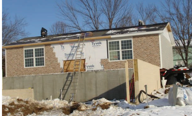
Red Bud Crown, located in Auburn & Pawnee City, Nebr., should complete construction in the fall of 2008.

I embrace the times where I can share some laughs and light hearted conversation with my fellow MHEG mates. I am a firm believer in having fun at work.